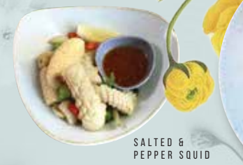
SALTED & PEPPER SQUID