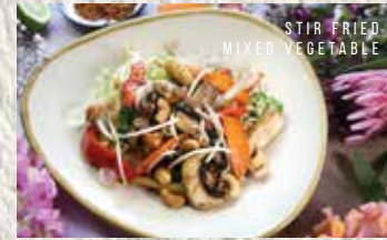
STIR FRIED MIXED VEGETABLE