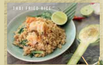
THAI FRIED RICE